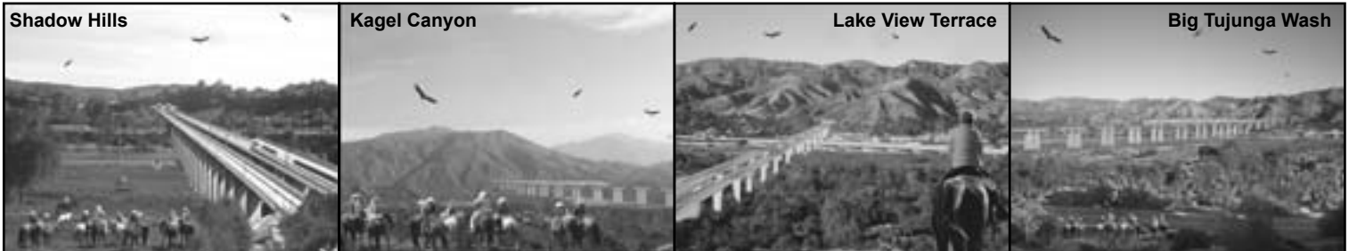
Elevated high speed train tunneling into Shadow Hills near Wentworth/Mary Bell intersection — Artist's Rendering.